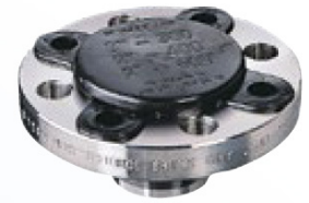
300 lbs. series