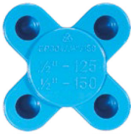
150 lbs. series

Suitable for ASA/ANSI/BS1560 fangles. Quick Fitting Simply insert plugs into the bolt holes .1/2" - 125/300 lbs to 12." - 150/300 lbs